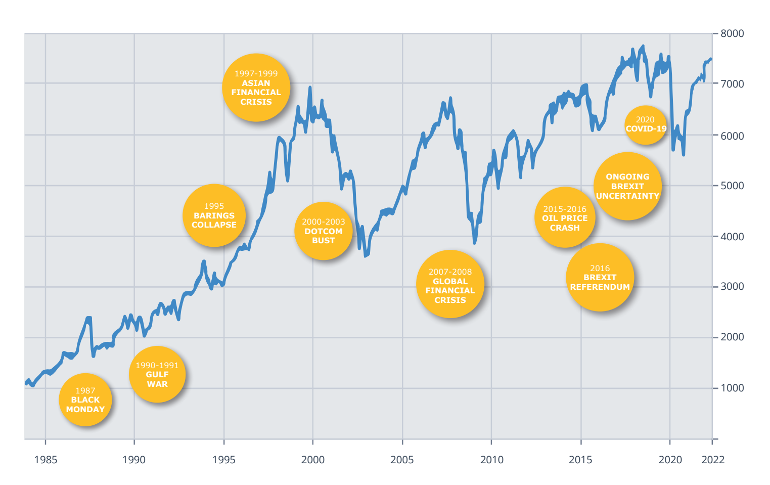
Chart: FTSE 100 since inception to 24 May 2022

The value of investments can go down as well as up and you may not get back the full amount you invested. The past is not a guide to future performance and past performance may not necessarily be repeated.