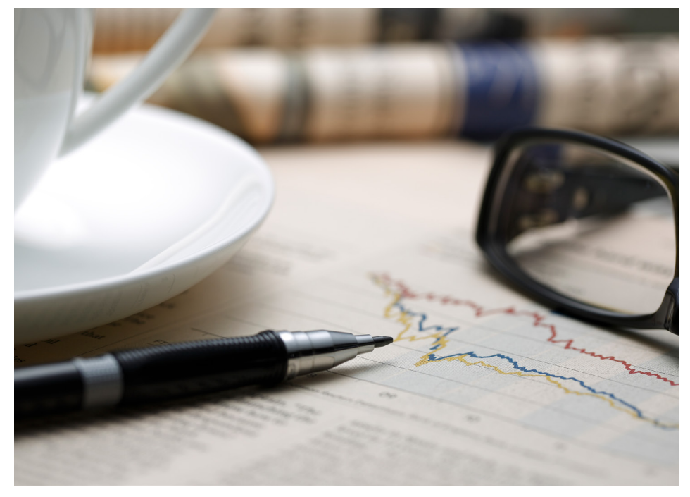
All details are correct at the time of writing (February 2025).

Financial advice and regular reviews are essential to help position your portfolio in line with your objectives and attitude to risk, and to develop a well-defined investment plan, tailored to your objectives and risk profile.