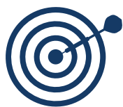
Focusing on your goals

The value of units can fall as well as rise, and you may not get back all of your original investment.